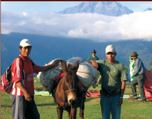
SAN FERNANDO CO-OPERATIVE, PERU

from PRODUCER CO-OPS to EQUAL EXCHANGE, A WORKER-OWNED CO-OP to CONSUMER FOOD CO-OPS.