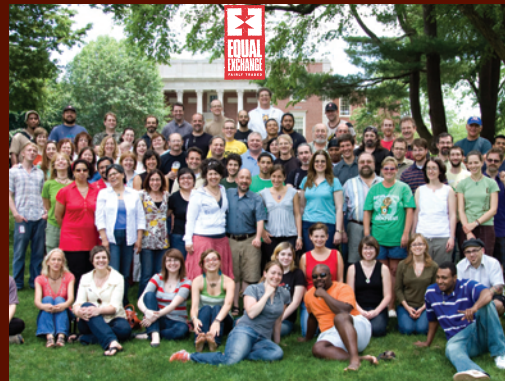
EQUAL EXCHANGE WORKER-OWNED CO-OPERATIVE