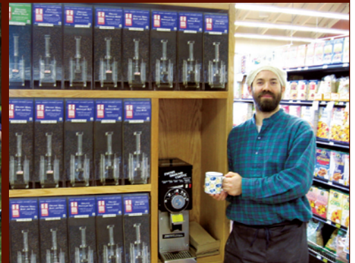
YOUR LOCAL FOOD CO-OP